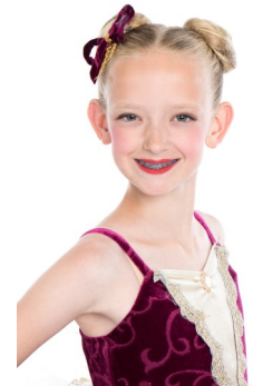
2 Medium High Buns

Parted in the middle. Very slicked and sprayed. 2 elastic bands placed behind ears.